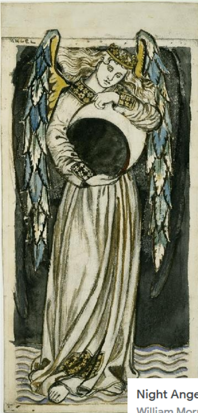
Night Angel Holding a Waning Moon William Morris c. 1862 - 1864

Why do you think the colours are different?