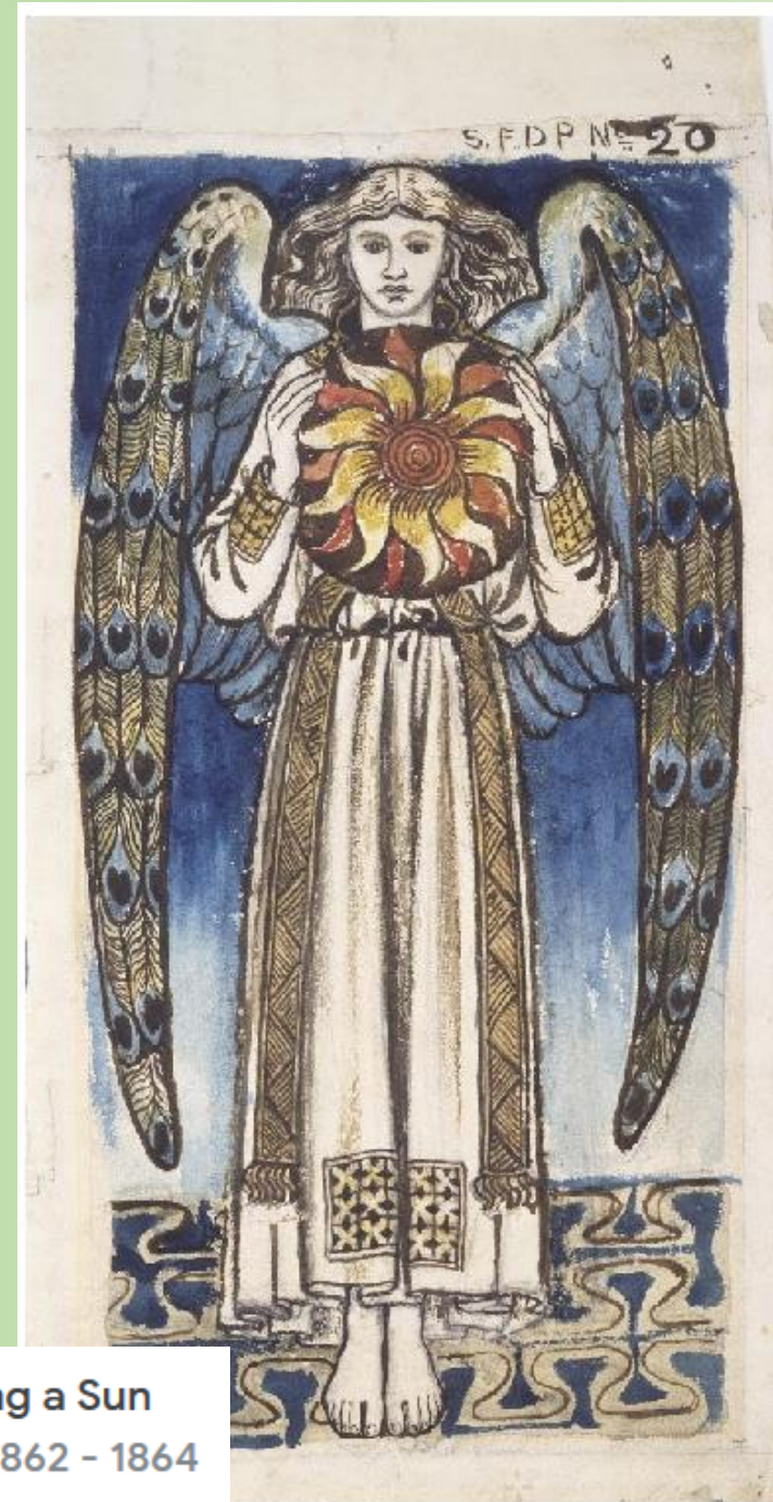
Day: Angel Holding a Sun William Morris c. 1862 - 1864