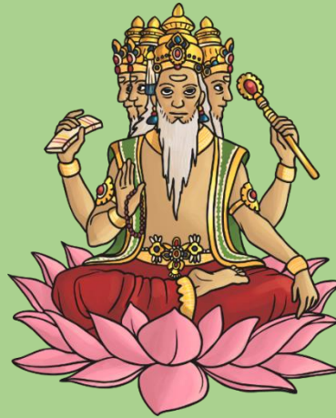
Brahma the creator