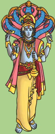
Vishnu the preserver

Remember, these are a representation of Brahman.