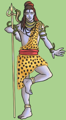
Shiva the destroyer