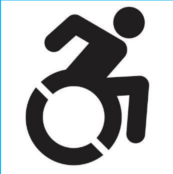
Accessible Icon Project

Write down your thoughts or discuss with someone in your home.