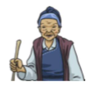
All older people need help to walk.