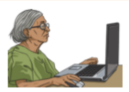
Older people can learn new skills.