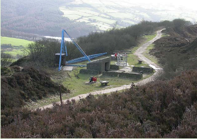
Tegg's Nose quarry, Macclesfield

The hill was quarried for millstone grit from the 16th century until 1955. Quarrying was originally by hand, giving a high-quality product used for buildings, gravestones, kerbs, flagstones and cobbles. In the 1930s, crushed stone was produced for roads and airfields, and during the Second World War, rock for runways was extracted using pneumatic drills.