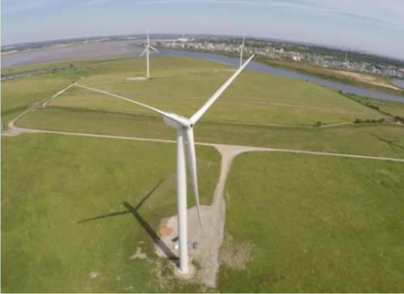
Frodsham wind farm

Built on the windy shores of the River Mersey, Frodsham wind farm is one of England's largest on shore wind farms.