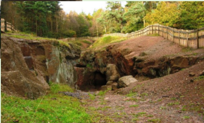
Alderley Edge mines

Alderley Edge is the oldest known metal-mining site in England, with evidence suggesting mining activity began as early as 1900 BC. Alderley Edge also has a Roman mineshaft, believed to date from the first century AD. A pot of Roman coins was found in this back-filled shaft that date from the fourth century AD.