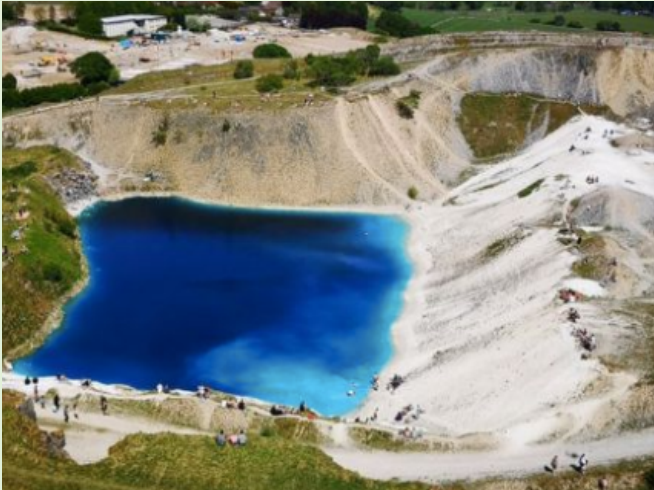
Harpur Hill quarry, Buxton

The hill was quarried for millstone grit from the 16th century until 1955. Quarrying was originally by hand, giving a high-quality product used for buildings, gravestones, kerbs, flagstones and cobbles. In the 1930s, crushed stone was produced for roads and airfields, and during the Second World War, rock for runways was extracted using pneumatic drills.