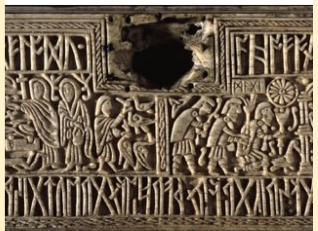
Runes and images, Franks Casket

A rune is an letter of an ancient Germanic language.