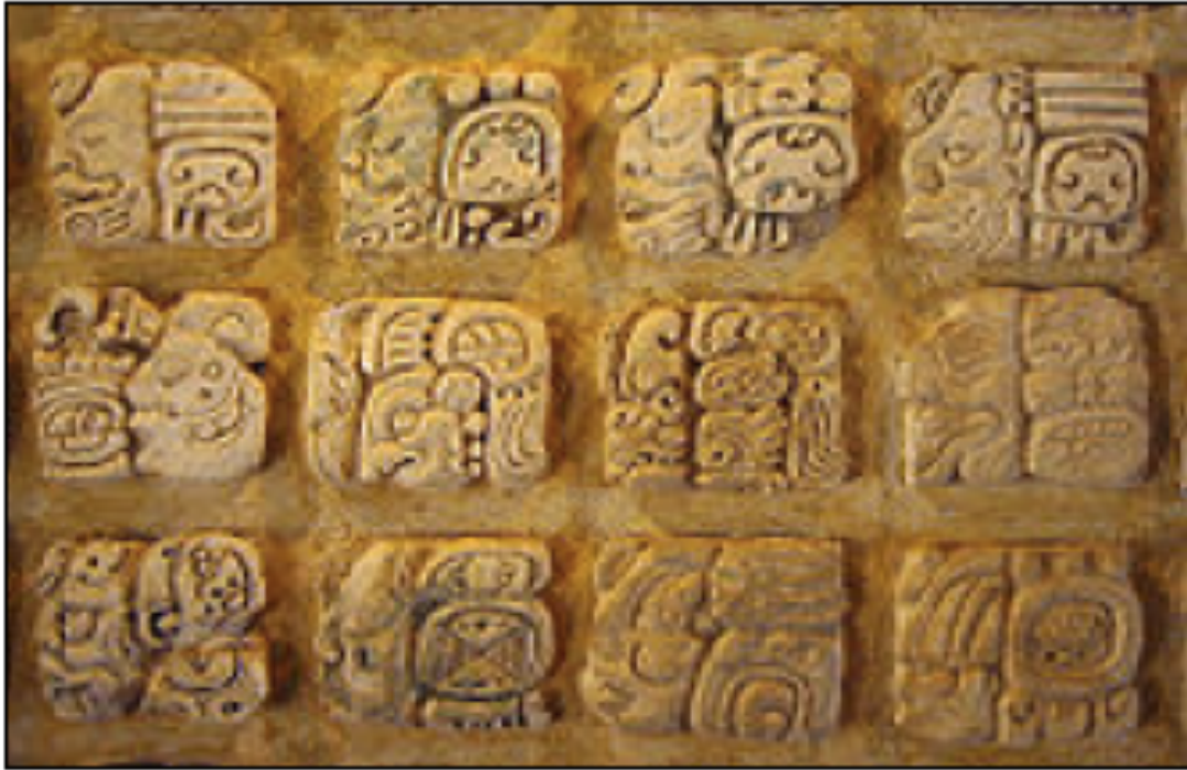
Glyphs carved on a monument

A glyph is a symbol that has an agreed meaning.