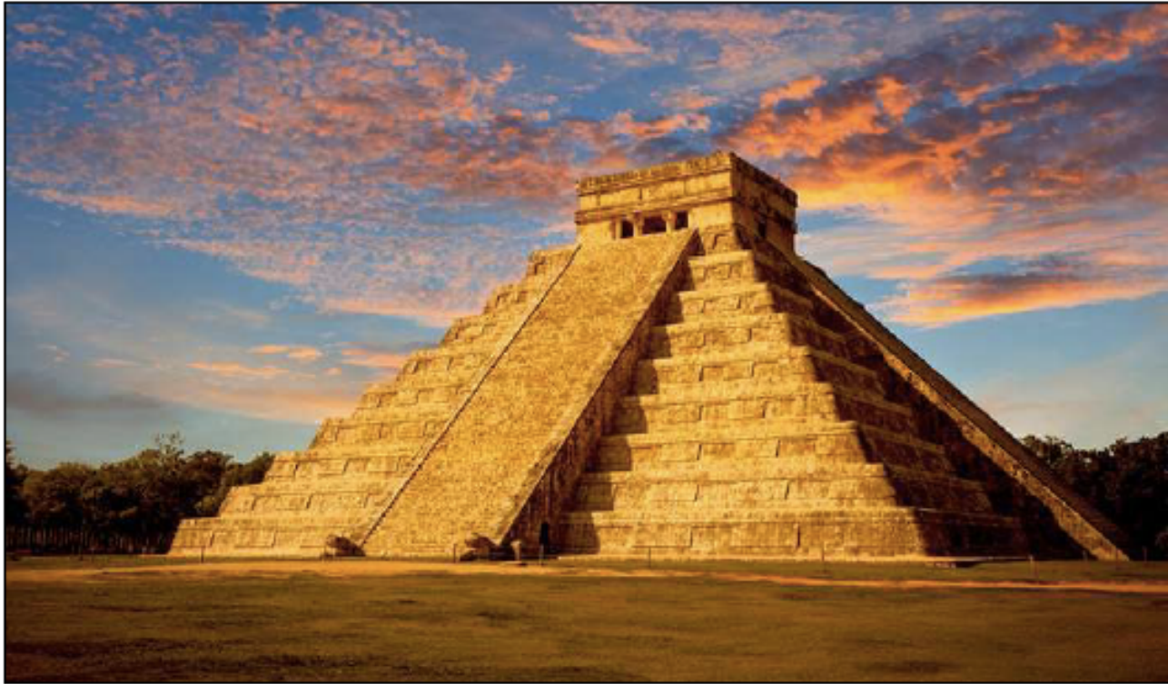
Pyramid at Chichen Itza