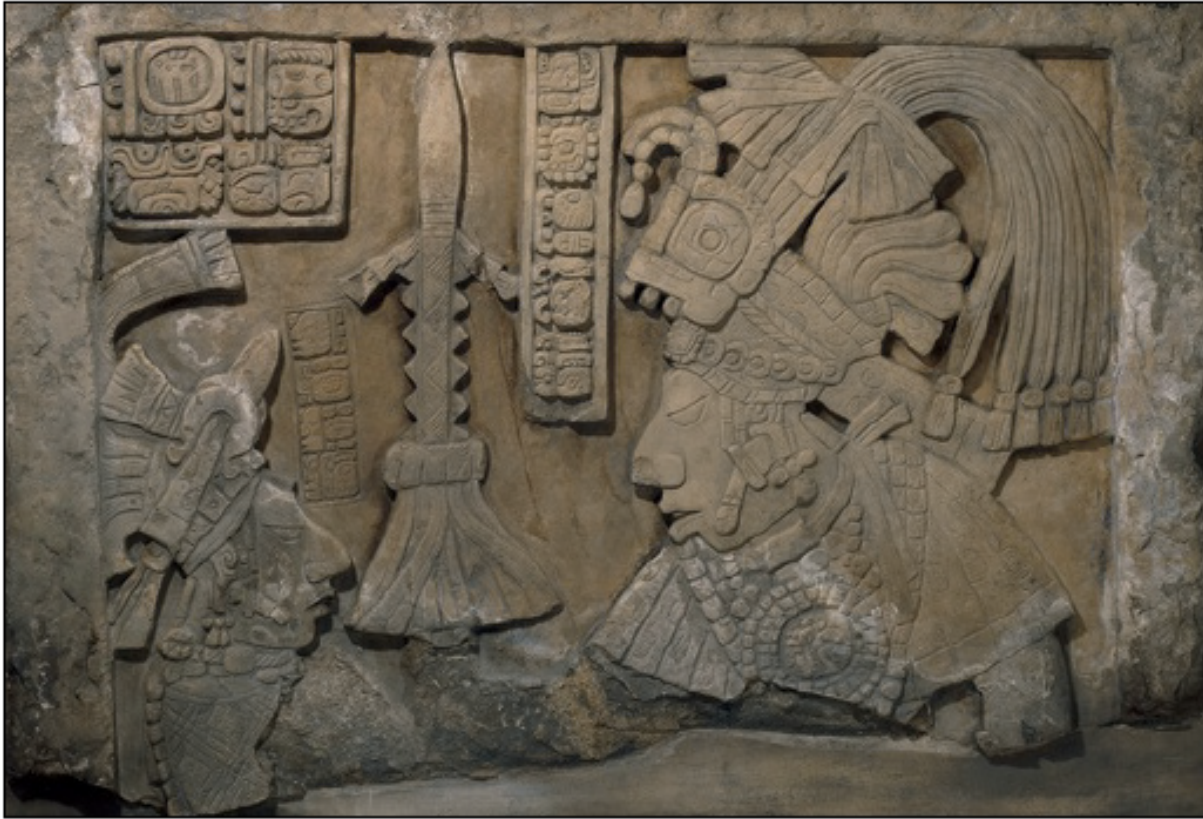
There were several rulers, this is Bird Jaguar VI on the right and his queen on the left.