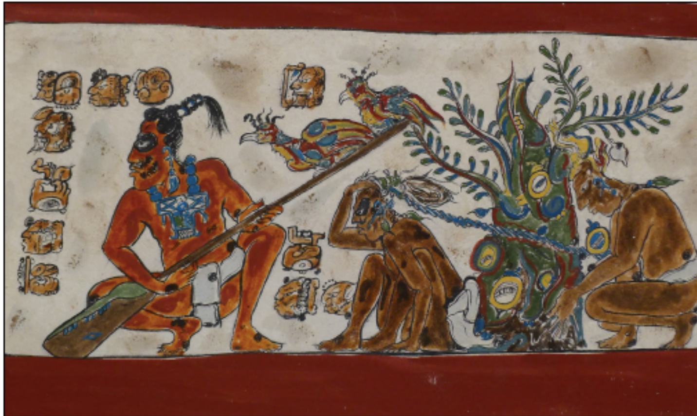
Creation story of Popol Vuh