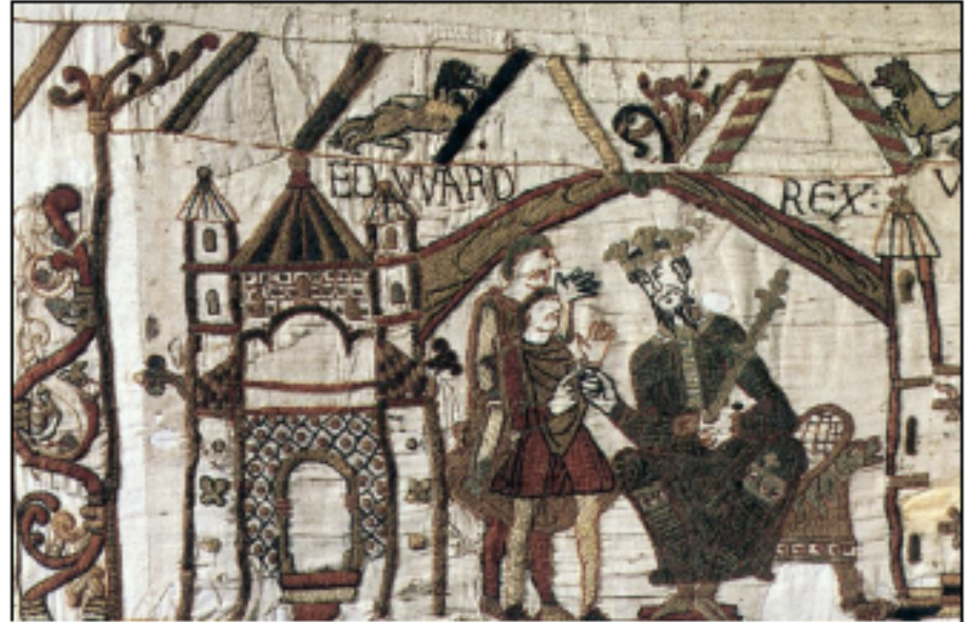
Harold is crowned King of England on 6th January 1066

There were lots of kings until King Alfred united the country.