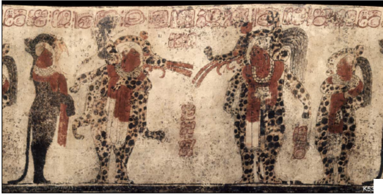
Two kings dressed as the Hero Twins who became the sun and moon