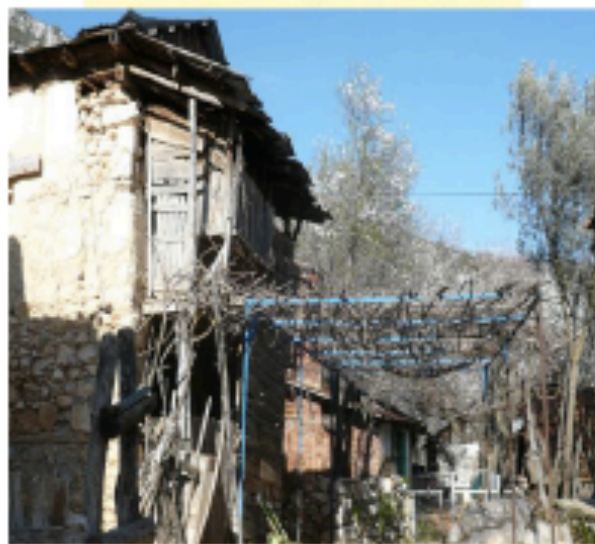
The estate agent role play

For sale! A ___ opportunity to buy this ___ house. This ___ building is perfect for people who like ___. It is ___ placed for the ___ and railway. The ___ garden and ___ car parking is a ___ bonus. It comes complete with a ___ that money just cannot buy. The ___ adds that ___ factor. The ___ price means that it won't last ___.